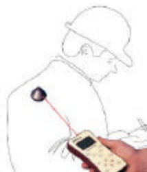
Controlled by Infra-Red